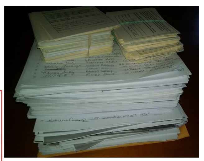
10,372 petition signatures are headed to Governor Cuomo's office

Justice and human dignity demand, however, that changes come to the industry in terms of how workers are treated."